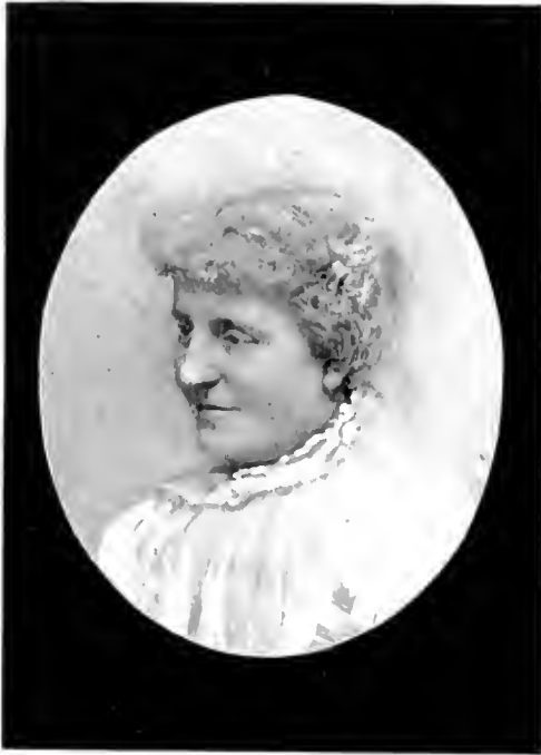
FRANCES HODGSON BURNETT.

BURNETT, Mrs. Frances Hodgson , novelist, born in Manchester, England, 24th November,